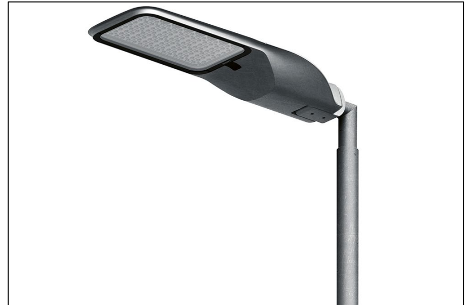
Example of a cobra streetlamp. Exact light, color and shape may vary.